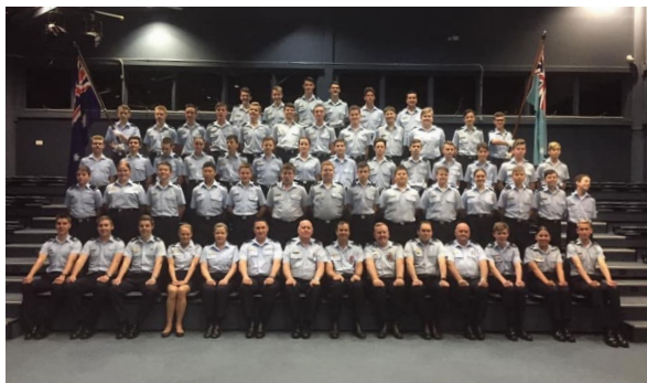
217 Sqn Air Force Cadet City of Redlands Group Photo

SQN photos were also taken this month, showing all of our Cadets in their Service Dress uniforms, looking sharp. It is a great snapshot of everyone's position in the SQN and I'm sure the photos will be brought up again when Cadets look back on the time they had at 217 SQN. Comparing this year's SQN photos to the previous years, it is clear that 217 SQN is growing each year with more and more young people interested in aviation and the ADF. Thankfully, our SQN is very appealing to the youth of the Redlands due to our excellent facilities and great reputation. Thank you to the RSL for always helping us uphold that reputation and providing us with the means to give our cadets a great experience.