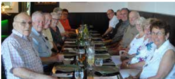
Pictured above: RAAFA Redlands Branch dining at Thai Siam Restaurant

In other social news, the Branch held the first Restaurant Dinner for the year on Wednesday 16th January at the Thai Siam Restaurant, Cleveland. A great night enjoyed by all in attendance. Our next social function will be a visit to the Queensland Air Museum, Caloundra followed by lunch with RAAFA Kawana Waters Branch on Sunday 10th March.