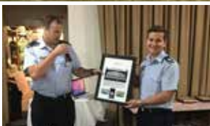
Pictured top: Graduation Tri Service Parade 2018.