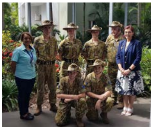
Cadet at a Nursing home Anzac Day

ANZAC Day is a special day, everyone is proud to be connected with it and we feel privileged that we get to play such a focal point in it. There is never any shortage of volunteers to help 'upstairs' or to help lay wreaths between the services. The highlight of the day is the March before the main commemorative service, it is a special occasion and one of nervous excitement particularly for those newer cadets who haven't marched before it is something they will never forget. This year we sent 5 cadets to a local nursing home who had residents that were not able to attend the service due to age and ill health. Logistically it worked out well and the cadets enjoyed the opportunity to talk one on one with some diggers.