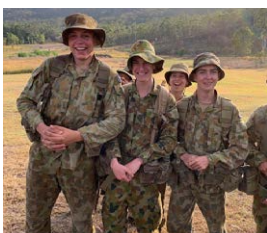
T3 early morning