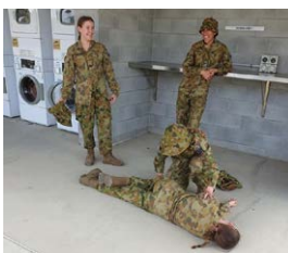
T2 First Aid elective