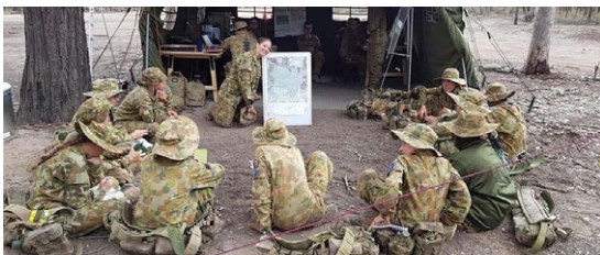
T1 getting briefing in the Bush