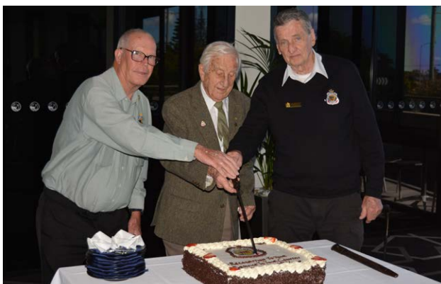
Cutting the cake.