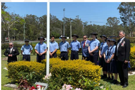
Students from Faith Lutheran College placing flags on Veteran graves at Great Southern Memorial Gardens at Carbrook.