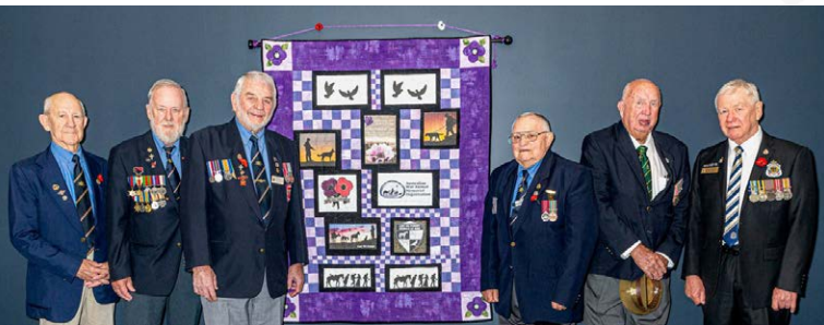
League members viewing AWAMO Poppy wall hanging for Remembrance Day during the Veterans Cuppa