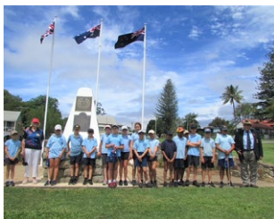
Stradbroke Island State School Stradbroke Island Cemetery