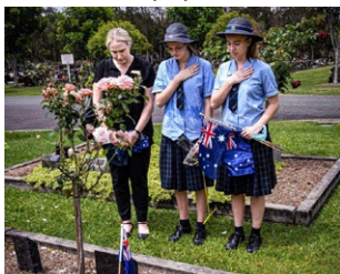
Faith Lutheran Collage Great Southern Cemetery