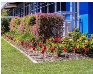
Cleveland High School Poppy tribute to the fallen with 1000 crocheted poppies along pathway