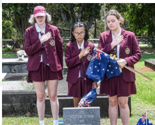
Cleveland High School Cleveland Cemetery