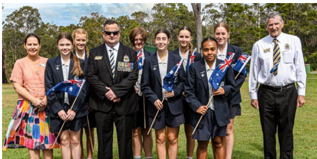
Victoria Point High School, Redland Bay Cemetery