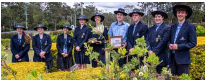
Faith Lutheran College at Great Southern Memorial Gardens Cemetery, Carbrook