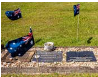
Victoria Point State High School at Redlands Cemetery