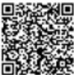
Sails Table Reservations