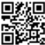
Spring a la carte menu