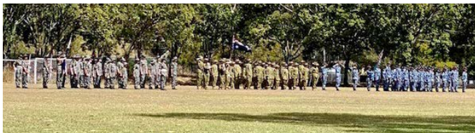
Army Navy Air Force Cadets forming up for the advance and review order during the Tri Service Parade.

136 ACU continues to excel as the premier unit within 13 Battalion and cadets are preparing for the annual field exercise being held at Greenbank training area and Canungra in September, but that's another story.