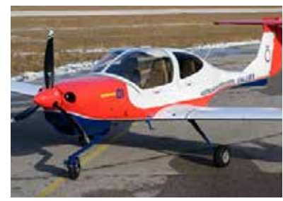
Pictured above: Australian Air Force Cadet training Aircraft the DA 40 NG

On the weekend of the 10th February 2024, 140 cadets from Moreton Flotilla (21 were from TS Norfolk) were invited to the Cadet Aviation Experience at RAAF Amberley. Throughout the