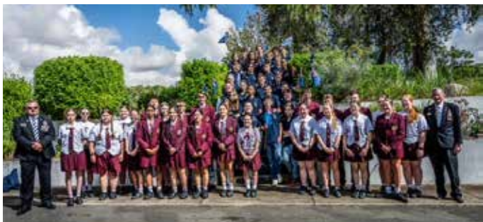
Cleveland High School and visiting French Students joined us at Cleveland Cemetery to Honour Our Fallen.

This year 30 Cleveland State High School Students, as well as 31 visiting French students joined us in this program. A big shout out to Stradbroke Island ferries who kindly helped transport sixty-one French and Cleveland High School students down to the Cleveland Cemetery. Their assistance was much appreciated.