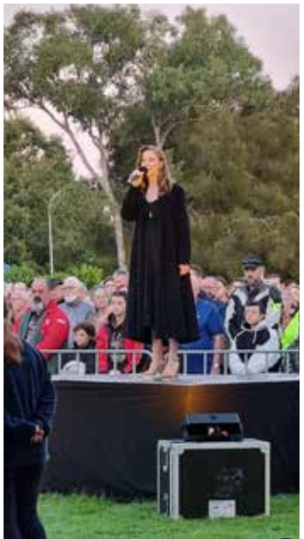
- dawn service -