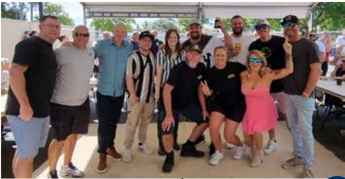
- anzac day 2024 -