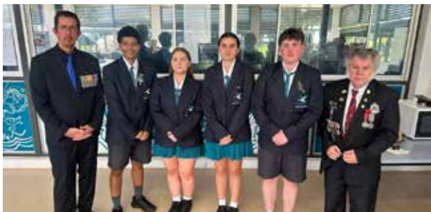
Wellington Point State High School Anzac Day Service 2025