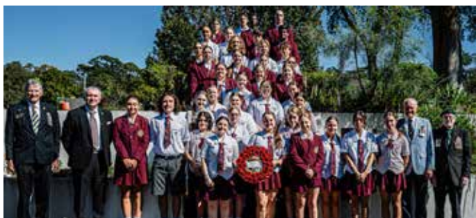
Cleveland High School Honouring the Fallen