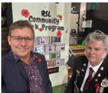
Wellington Point State High School Anzac Day Service 2025