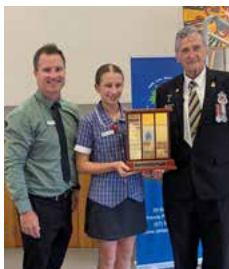
St. Rita's Primary School

Anzac Day was an extremely wet day however, dawn and main service and parade were still well attended. I must say, I was extremely impressed with the three Cadet Units who stood at attention and didn't flinch during the pouring rain as the Veterans marched to the Cenotaph.