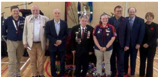
North Redlands Youth Leaders Anzac Day Service 2025