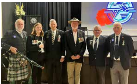
Victoria Point State High School

During April, my task was to attend Victoria Point High School and St. Rita's primary school at Victoria Point to be part of their Anzac Day Services to recite the Ode and lay a wreath on behalf of our Sub Branch. In addition I had the pleasure to present the RSL trophy to a student who achieved the highest student award for this year.