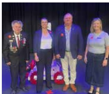
Hilliards State School Anzac Day Service 2025