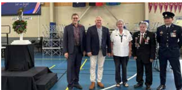
Birkdale State School Anzac Day Service 2025

This year I attended and gave a talk at Alexandra Hills State School, Birkdale State School, Coolnwynpin State School, Hillard State School, Wellington Point State School and Wellington Point State High School for their in-School Anzac Services. On Anzac Day I attended and gave a talk at North Redlands Youth Leaders Anzac Day Service. This year makes 16 years that I have attended and gave a talk at Birkdale State School and North Redlands Youth Leaders Anzac Day Service.